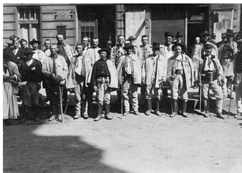
The convention of the Agrarian Party in 1921